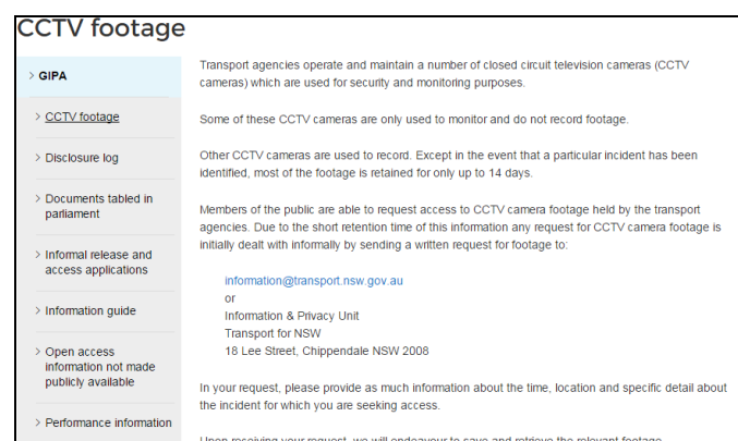
Figure 2: Extract from Transport for NSW website on how to access CCTV footage held 3

For example, on its ‘Information Access’ webpage, Transport for NSW provides information to the public on how to access CCTV footage held by the agency (see Figure 2). Of particular note is that the page advises the public that CCTV may be held for only a short time, and that an informal application under the GIPA Act is encouraged.